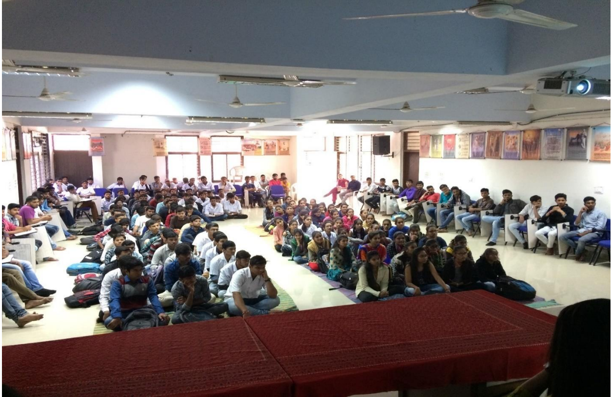
On date 10/08/2019 a seminar was organized by CWDC, GSC Gandhinagar and civil defense unit Gandhinagar on the topic “ Motivation of girl’s education and awareness of law and important helpline numbers related to women’s safety.” About 100 students have participated in this program.