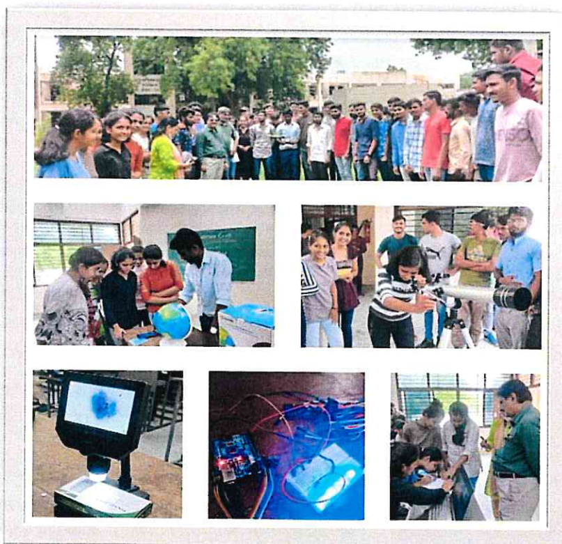
"Prabodh"- Level DIY kit training held at Government Science College Gandhinagar during 18/07/22 to 21/07/22

Total sixty students from various faculties of Science like Physics, Chemistry, Mathematics, Botany, Zoology and Microbiology were benefitted by the training.