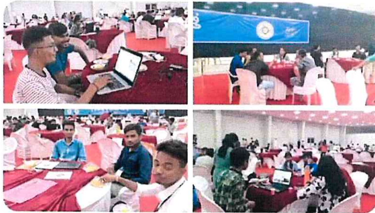
Dept of Science & Technology, Gujarat and 9 others